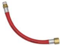
33304 91488205 Hose whip, 1/2" NPT, 13 mm inside diameter, 40 cm (1 ft)