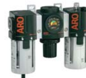
Filters, regulators, lubricators For the complete range, see our accessory catalogue.