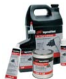
Lubricants For the complete range, see our accessory catalogue.