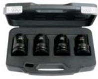
SK8M4L 81287419 1" Impact socket set (4 pcs) (27, 30, 32 and 33 mm)