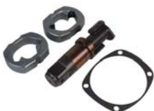
2190-THK1 80137698 Impact mechanism service kit