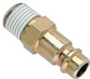
IB11NMC4 25014036 IBN/IBS Series nipple, 1/2" male thread, 11 mm bore (ISO6150B / MIL-C4109)