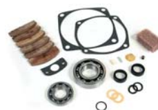
2190-TK1 80137383 Motor service kit

Contact: sales@appliedtorque.co.uk for Further Information