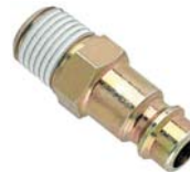
77NMC4 88104096 7N7/7S7 Series nipple, 1/2" male thread, 7.2 mm bore (EURO 7.2 - 7.4)