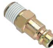
IB8NMC4 88103312 IBN/IBS Series nipple, 1/2" male thread, 8 mm bore (ISO6150B / MIL-C4109)