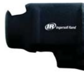
2190-BOOT 45505419 Protective tool boot