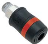
Quick Release Couplings For the complete range, see our accessory catalogue.