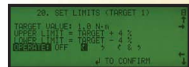
Limit Setting Screen

Resolution: 5 digits for all Norbar transducers. Weight: 2.2 kg (4.8 lb). Dimensions: 160 mm deep x 288 mm wide x 72 mm high.