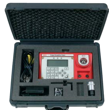
TST in standard carry case.