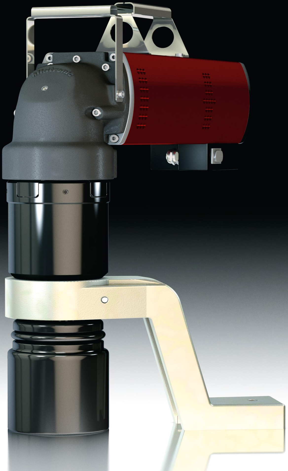
EF Electric Torque Multiplier