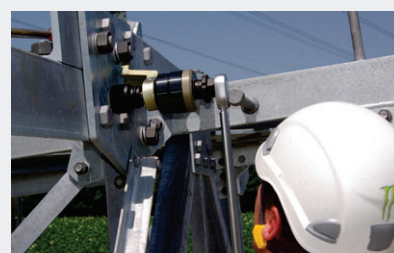
alkitronic® M operating on electricity pylons. Accurate tightening via torque wrench.