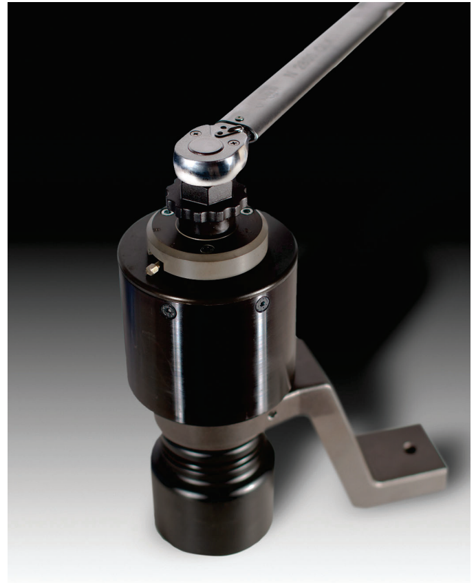
Technical Data: Modell H (without ratchet) and HG (with ratchet)