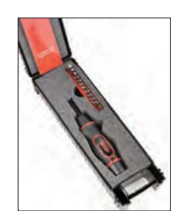
Torque Screwdriver Kit