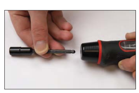
Bit holder can be removed and replaced with widely available