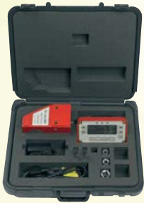
Pro-Test display and transducer in carry case.