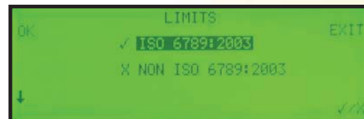
Limit type selection