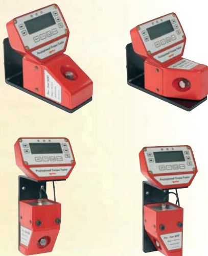
Flexible mounting options of Pro-Test on Bracket, Part No. 62198.BLK9005