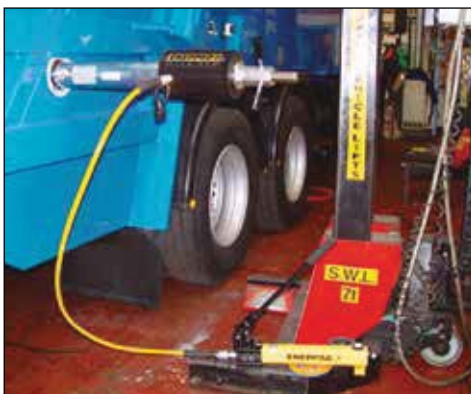
◀ An RACH-306 powered by a P-392 hand pump used to extract corroded carriage pins of refuse collection vehicles.