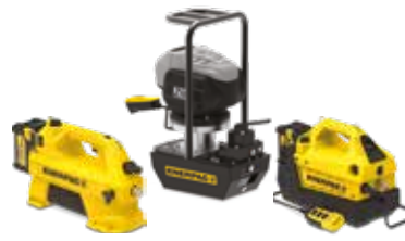
Cordless Hydraulic Pumps