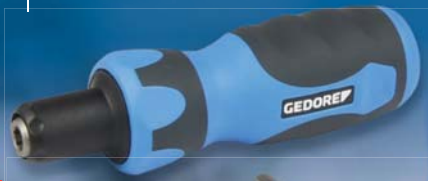
Pro 25 & 150

To allow for customisation and clear identification interchangeable coloured end caps are available in packs of four (Order Code: 065800)