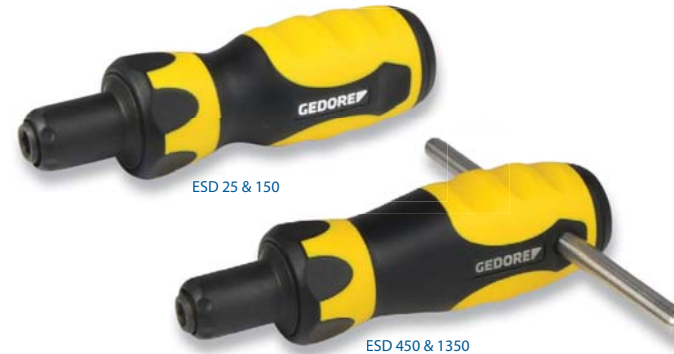
ESD 25 & 150