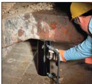
◀ An RAR-506 was easy to position under a bulldozer for repair of frame member.