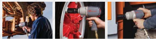
Assembly and Disassembly of machinery and heavy equipment

*Available in 3" and 6" extended anvils.