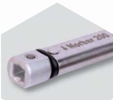
Female Torque Handle

NEW FASTER ADJUSTMENT The scale adjusts twice as fast but the effort required is reduced