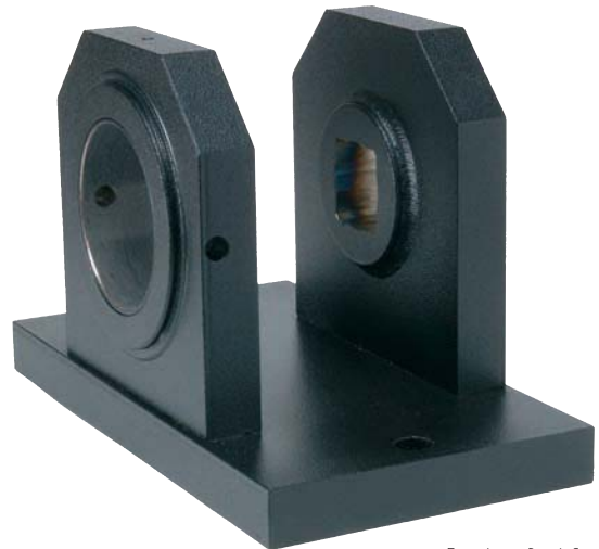
Extra Large Bench Stand